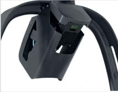
2D curtain laser for obstacle detection