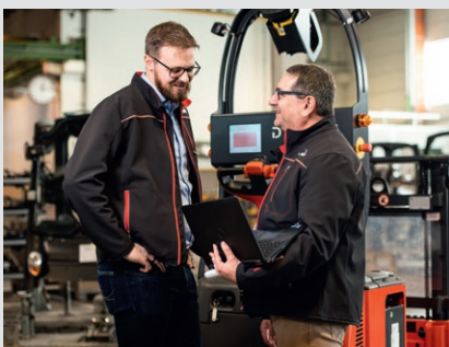
Process-oriented as standard