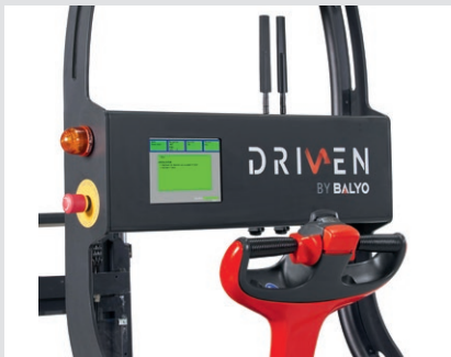
Manual operation option