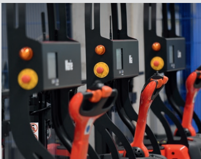
Excellent operational availability